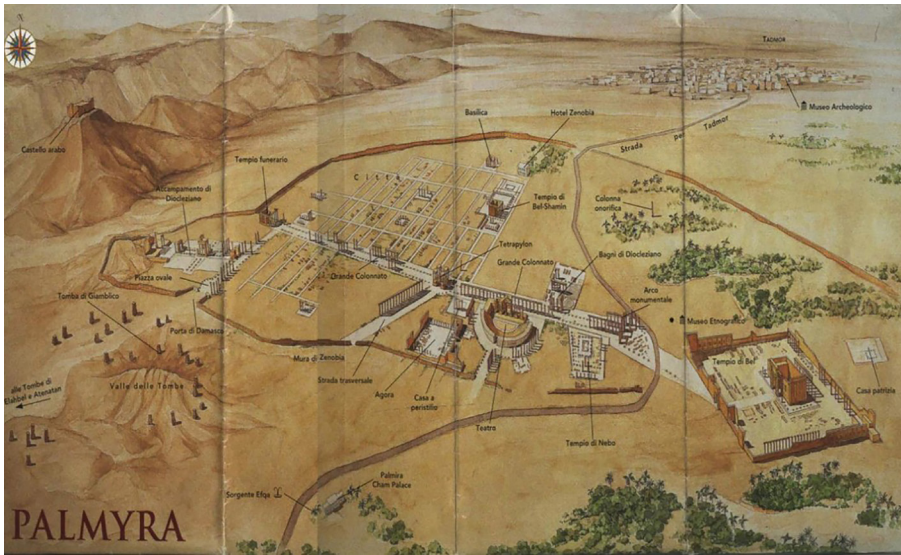
2 A tourist map from the archive shows a reconstruction of Diocletian Palmyra (284–305 AD). (Plan: CC BY-SA 4.0, Directorate General of Antiquities and Museum (DGAM))

Mediterranean. It grew gradually on the trade routes from approximately 44 BC to 272 AD, making it the crossroads of several civilisations [2].