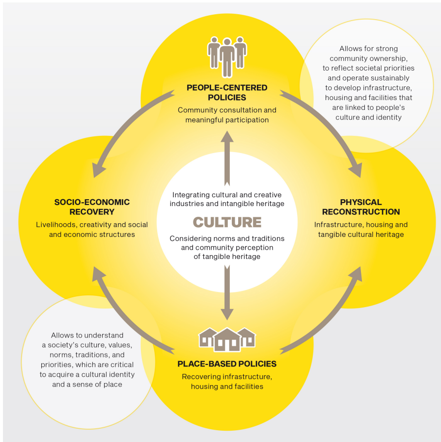
6 Culture in city reconstruction and recovery framework (2018). (Design: CC-BY-SA 3.0 IGO, Jean-Luc Thierry in UNESCO – World Bank 2018, 24)

all relevant actors to solve problems and address the complexities of recovery – not only to stimulate economic and social development but at the same time to create a peaceful environment that prevents a return to violence [23] (Fig. 6).