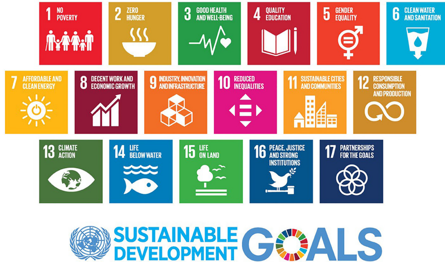
3 The 17 goals of the UN for sustainable development. (Design: Vanessa Paris in ICOMOS 2021, 16)

pattern of resource use that balances the achievement of basic human needs with the wise use of limited resources, which can be passed down to future generations and can be understood in two ways: