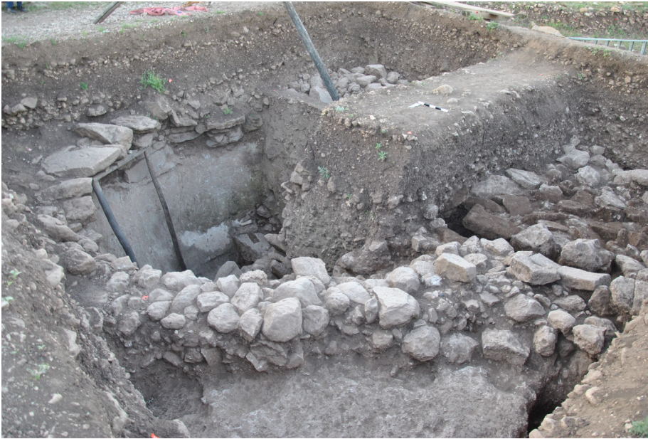
6 A large pit carved into the limestone bedrock is so far unique and might have served as a cistern for the collection of rainwater (cf. Fig. 1, E).

came to light in trench K10-55 (Fig. 1: E. Fig. 6). At present, little is known about the function(s) of this feature, which was found to contain, among other things, large numbers of worked limestone slabs, in some places piled up high on to its full height; however, given the evidence of prehistoric »rainwater-harvesting« from the adjacent plateau, including carved channels and »cisterns« in the natural bedrock, its interpretation as a component in an on-site water-acquisition system is a distinct possibility. Support for this interpretation comes from nearby trench K10-35 where a sounding excavated by Klaus Schmidt in 2013 revealed a carved channel in the natural bedrock. Notably, this channel section, located just 12 metres to the west of the new »cistern«, had been carefully protected with a cover of limestone slabs.