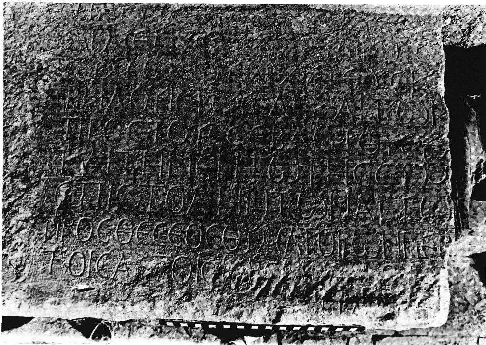
Antonine inscription from Qaşr el Heir, as uncovered in 1972.