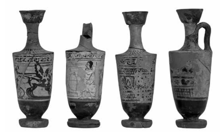
Fig. 12 Athens, Kerameikos. Vases from burial H 82

a mirror in her outstretched hand. The ornament lekythoi are all from the Beldam workshop, and seven of the twelve are very similar in size and shape and have the same patterns of decoration. We can imagine that these seven at least were purchased as a lot for the funeral, with a clear desire to make a large offering. Given the generic imagery of the two figure-decorated vases, the number of vases present in the grave is clearly more significant in making statements about the dead than the imagery on the vases<sup>44</sup>.