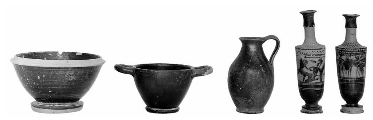
Fig. 10 Athens, Kerameikos. Vases from burial SW 130