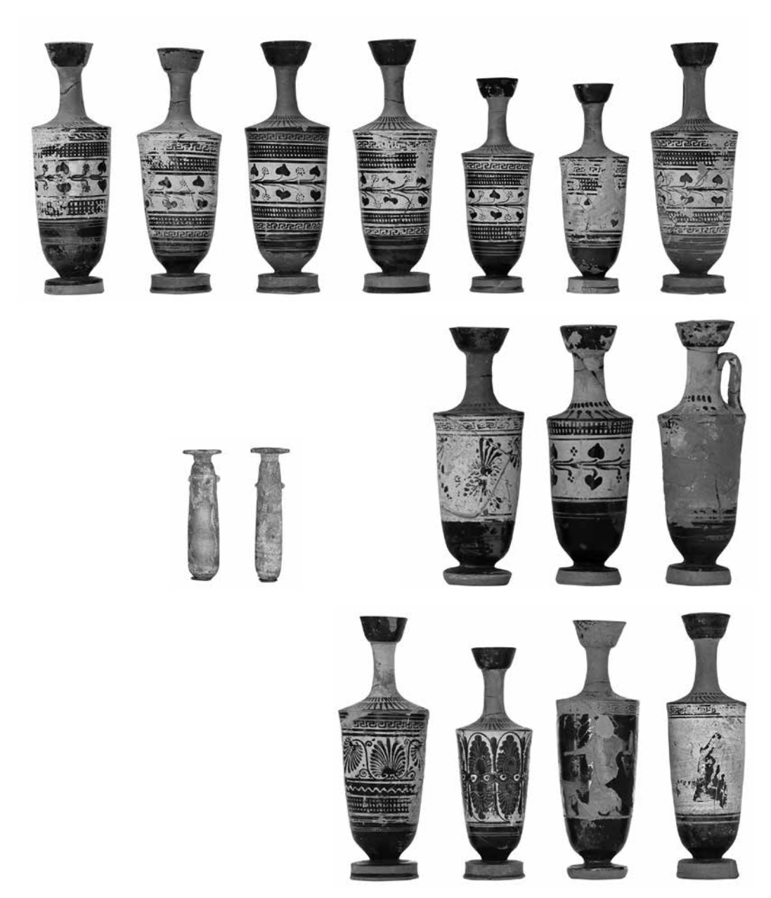
Fig. 11 Athens, Kerameikos. Vases from burial S 12