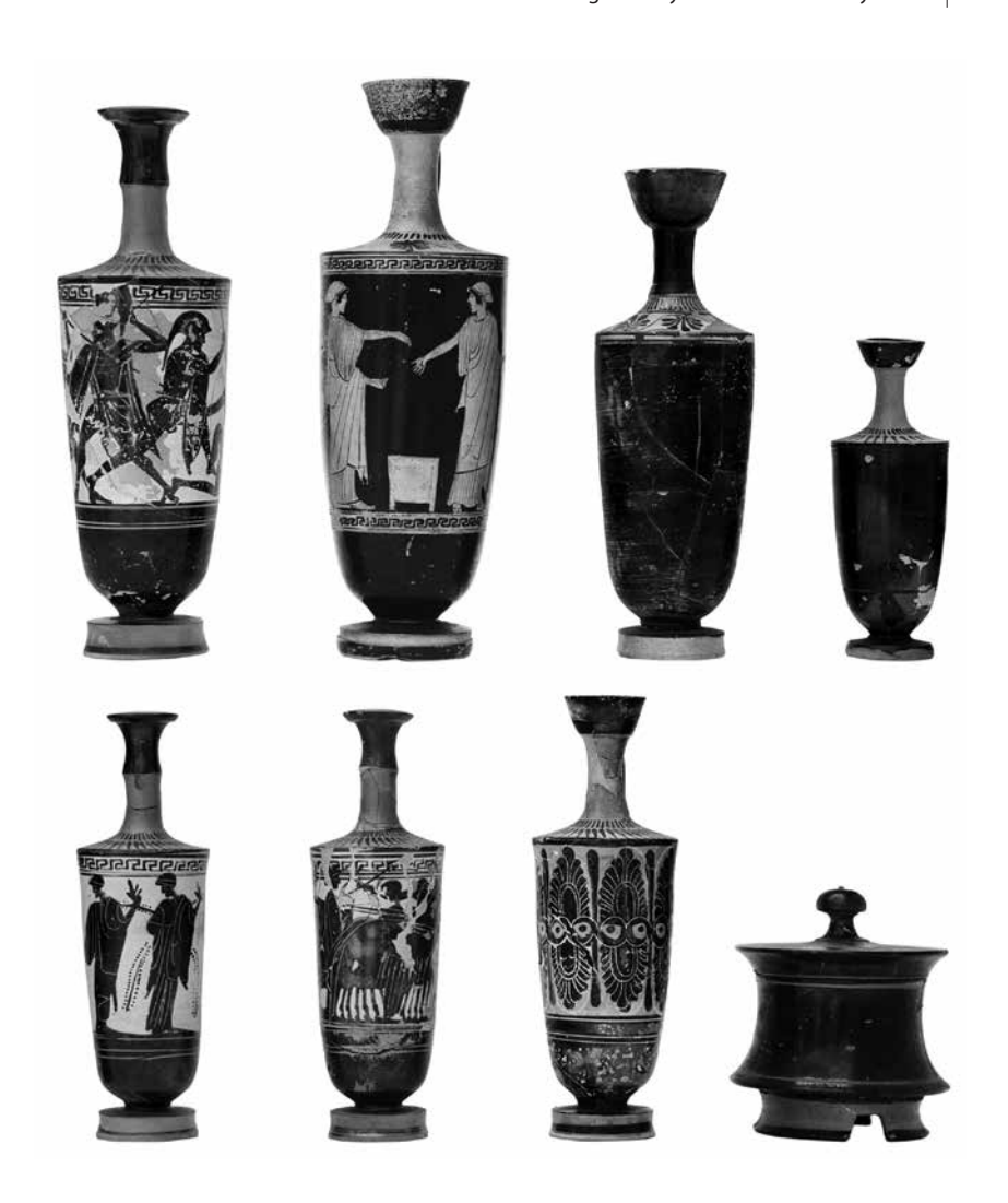
Fig. 7 Athens, Kerameikos. Vases from burial 35 HTR 47 II

have been preferred for deceased of one gender and may have also served as an opportunity for display by offering objects beyond the ritual requirements<sup>35</sup>.