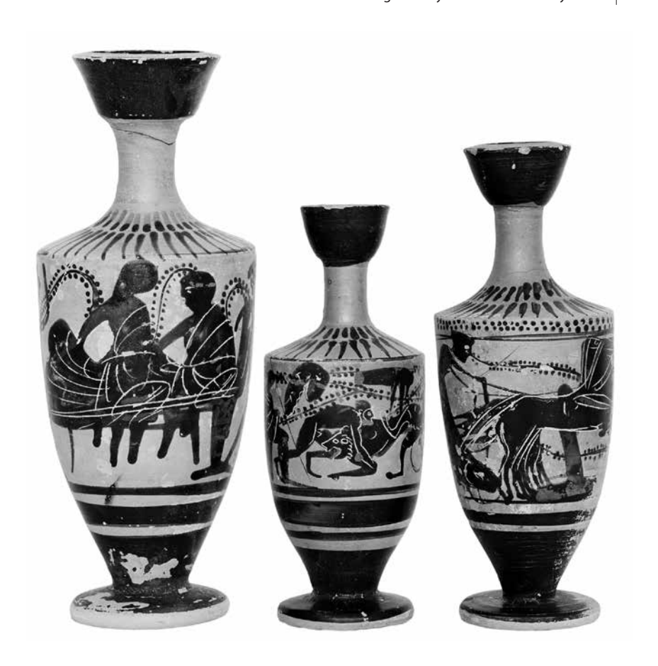
Fig. 4 Athens, Kerameikos, Vases from burial SW 69

burial, the scene has minimal incised detail. All three vases are of a similar shape and craftsmanship, with similarly hasty painting. These vases are remarkable with regard to neither their iconography nor their style and are representative of child burials (and really all burials) of the period.