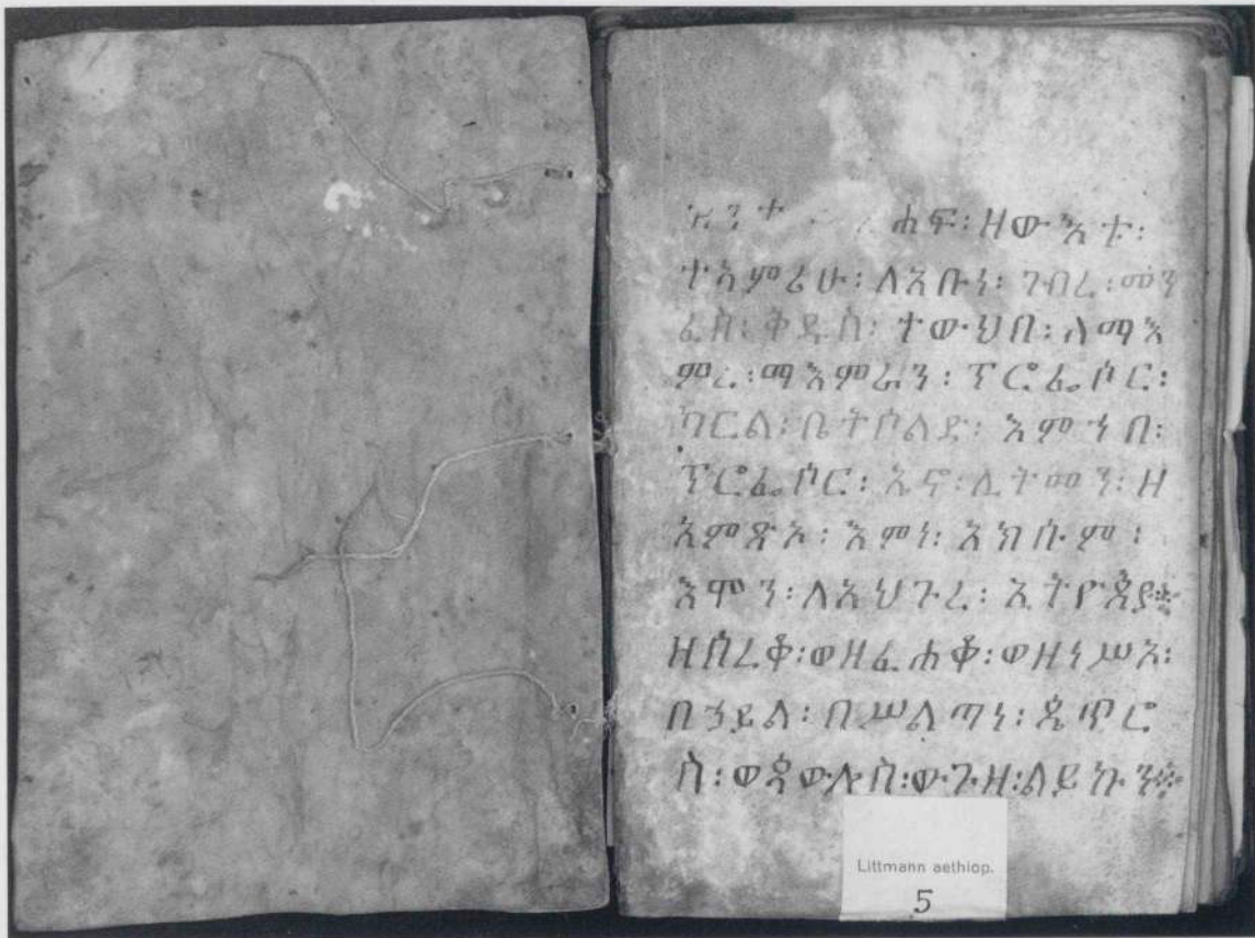
Fig. 1 Ex-dono in Ge'ez in the manuscript of the „Miracles of Saint Gabra Manfas Qeddus” (Halle, ms. Littmann no. 5), testifying that the codex was given to ma'emerā ma'emeran Carl Bezold by “profesor” Enno Littmann who bought it in Aksum, in the country of Ethiopia. “May he be cursed by the power of Peter and Paul the one who erase, modify or take away this book.”