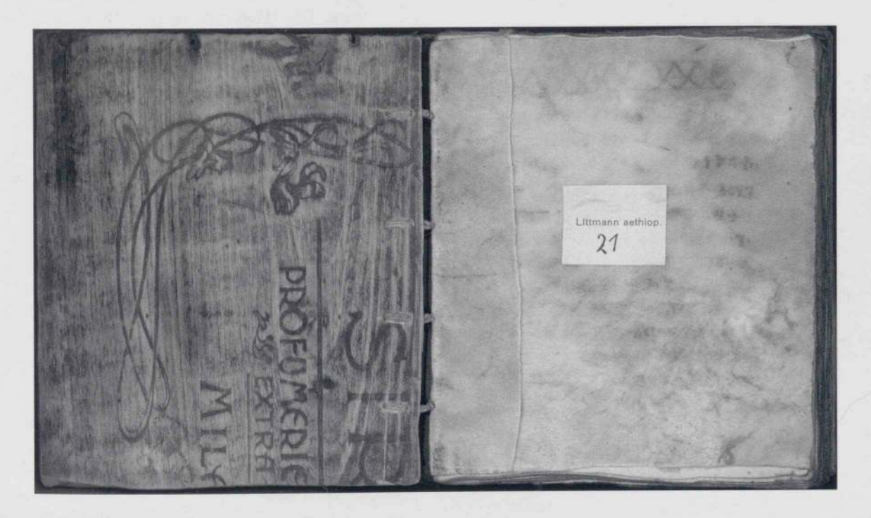
Fig. 2 Use of an Italian manufactured perfume box to make the wooden board of the codex Halle ms. Littmann no. 2.